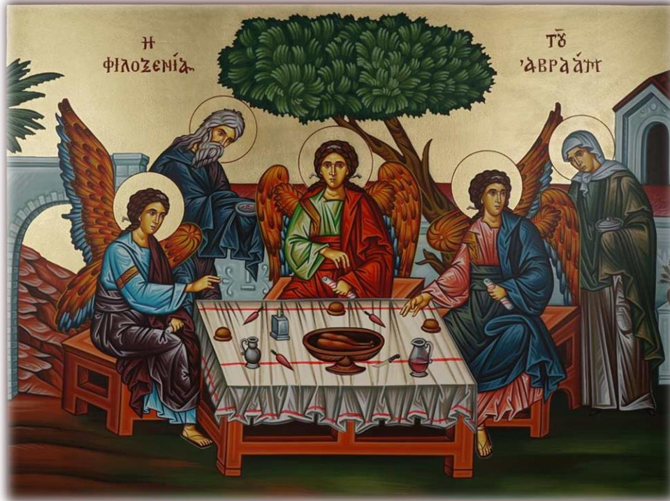
THE PHILOXENIA OR HOSPITALITY OF ABRAHAM AND SARAH

He could have helped him but he failed to do so. The patriarch was not like that but just the opposite. He would sit in his doorway and catch all who passed by. And just as a fisherman casting a net into the sea hauls up fish, yes, but also quite often gold and pearls, so Abraham whilst catching people in his net finished by catching angels, though strangely enough without knowing it. Even Paul marvels at this and gives the advice: Remember to welcome strangers into your homes, for some by so doing have entertained angels without knowing it. And he did well to say without knowing it, for if Abraham had welcomed his guests with such kindness because he knew who they were he would have done nothing remarkable. He is praiseworthy only because, without knowing who the passers-by were and taking them to be simply human wayfarers, he yet invited them in with so much good will. St John Chrysostom