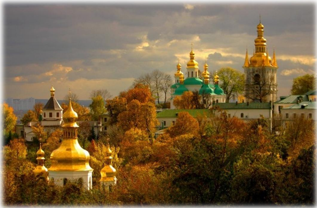
Києво-Печерська лавра Kiev Monastery of the Caves