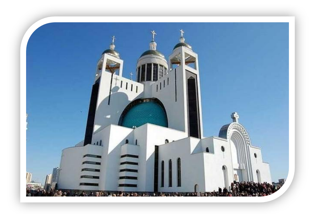
~ Cathedral of the Resurrection of Christ ~

The Ukrainian Greek Catholic Church's newly constructed patriarchal Cathedral of the Resurrection of Christ was consecrated on 17 – 18 August 2013 (eve of the feast of the Transfiguration, Old Calendar) by his Beatitude Sviatoslav Schevchuk. Over 20,000 pilgrims attended the dedication of the 1,500-seat cathedral, which took over a decade to build at a cost of 10 million dollars with donations from Ukrainian Catholics worldwide. Let us pray for a peaceful resolution to the conflict in Ukraine as Christ and Prince Vladimir – Equal to the Apostles would want! May the «Pokrov» of the Theotokos be cast over all Ukrainians!